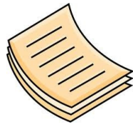
Emmaus Application and Sponsor Forms

Once the applications & sponsor forms are completed, you can bring them to the gathering or you can mail them to: Foothills Emmaus Community PO Box 25024 Orchard Park Greenville, SC 29616.