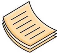
Emmaus Application and Sponsor Forms

Please send an email to the Prayer Chair prayer@foothillsemmaus.org if you have a prayer request to have the support of the community in offering your prayer up to our Lord